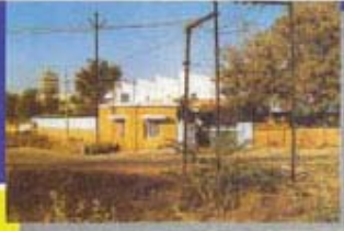
The full fledged production unit at Jodhpur.