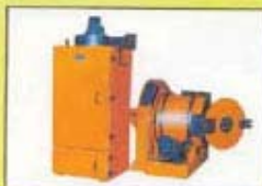
Model - R B F