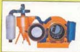
Model - R B C