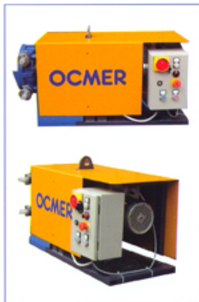
ODP - 018