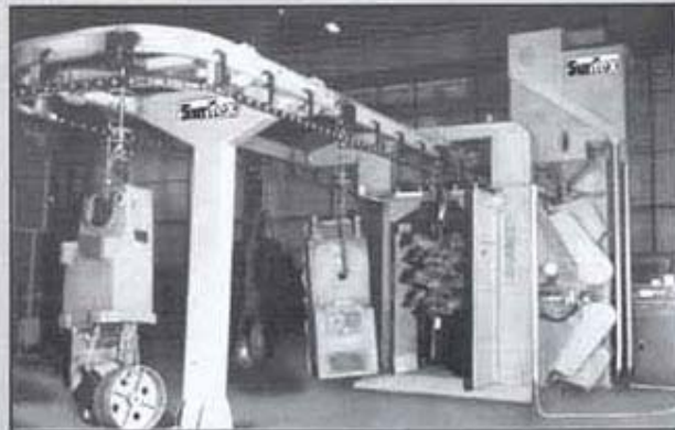
Inline Continuous Loop Hanger Type Shot Blasting Machine for High Production Application