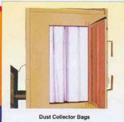
Dust Collector Bags