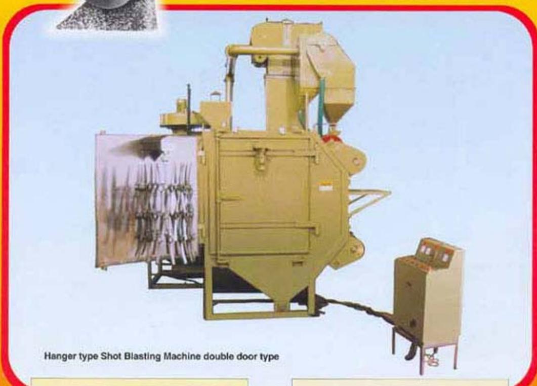
Hanger type Shot Blasting Machine double door type